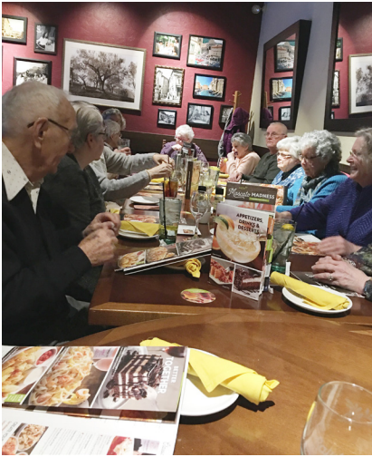
Dinner at Olive Garden following the performance of "The Odd Couple-Female Version."