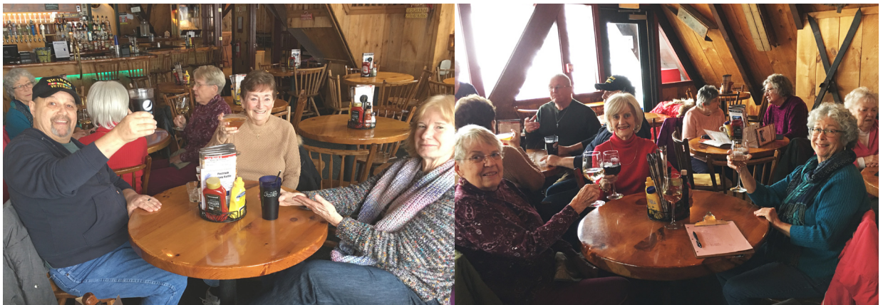
Delicious lunch at Pat's Peak Sled Pub!