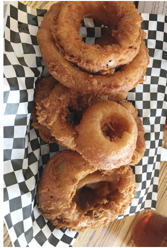
Exploring Newport with lunch at the Salt Hill Pub – BEST onion rings ever!!!