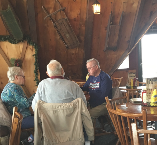
Enjoying lunch in the Sled Pub at Pats Peak.