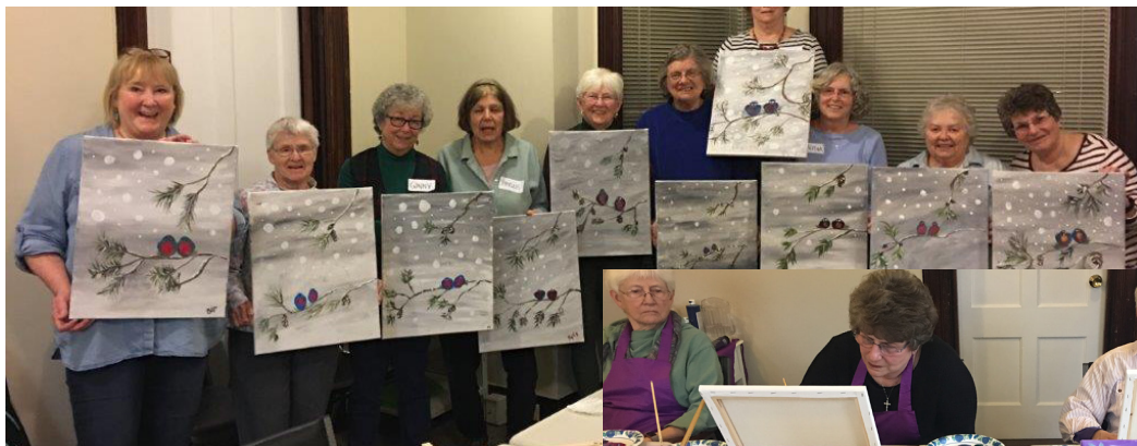
(above) Winter lovebirds.