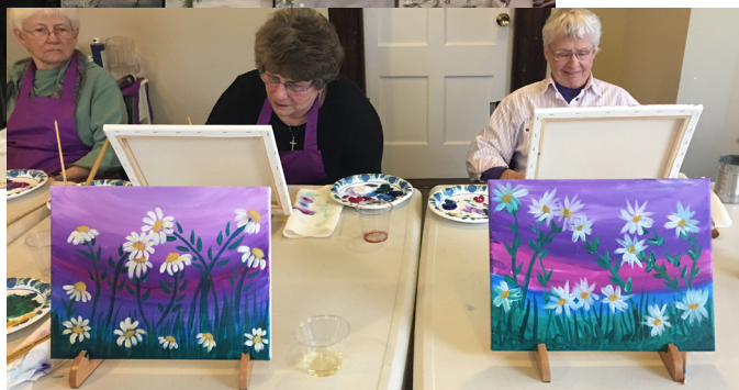
(right) Springtime daisies.

On Friday August 17th starting at 5:00 PM, we will have another pizza and paint night. We will start the evening with pizza and wine, then Elaine Emerson will lead us stroke by stroke as we create a beautiful painting. We will continue with our seasonal theme and do a summer picture with a